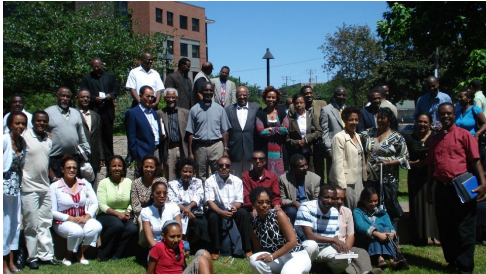
Evangelical Mekane Yesus Lutheran Fellowship of North America and Europe conference, held in Minneapolis Minnesota, in July 2008.